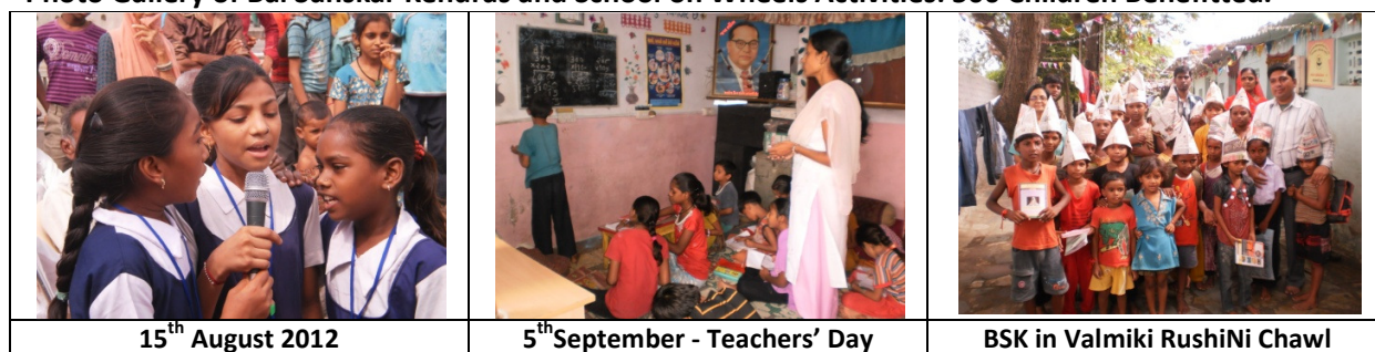
Photo Gallery of Bal Sanskar Kendras and School on Wheels Activities: 500 Children Benefitted.