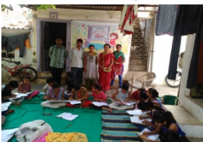
NEP at The Serenity Library