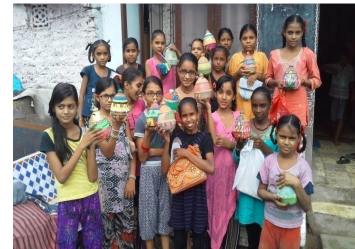
250 Gallas to save our Pocket Money!