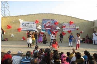
Packed Ambadker Open Air theatre, Ranip on Christmas Day Celebration