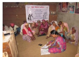
MPDB Elder's Support Program