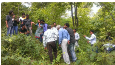
PBR Making Process under GBB Projects