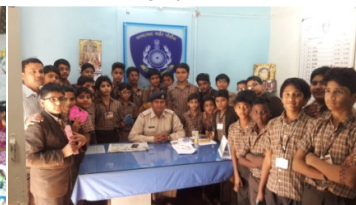
Satsang at Chotila by NVM