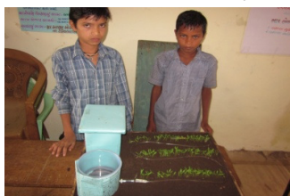
Harit Sena students in Science Fair